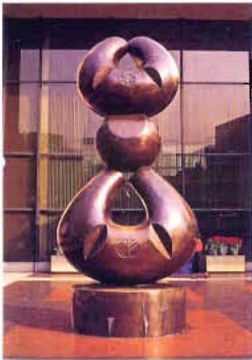
Sculpture in front of the head office of Kasikorn bank, Phahonyotin road

Installing sculpture at central areas will bring city the landmarks and meeting points for visitors such as the Victory Monument. The sculptures installed at major intersection, junction or along the main roads such as Sathorn road, Sukhumvit road, Rama IV road and Pahonyothin will provide the public with resting areas for taking a break from a stressful journey.