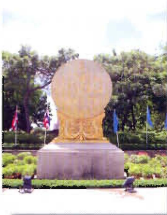
Commemorative Coin of Queen Sirikit installed at Benchasiri Park, KlongToey

In present, installing sculptures in major areas of the district such as the public parks including Lumpini park, Wachira Benjatas park, Jatujak park and Benchasiri park will improve the landscape while impressing the visitors because of the beautiful scenery.