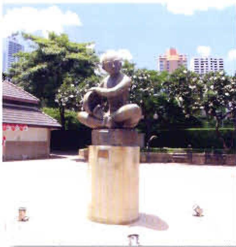
"Rammana" installed at Benchasiri Park, Klong Toey