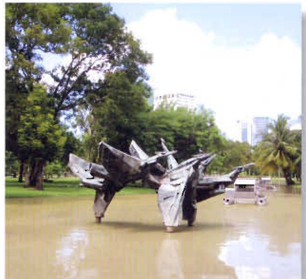
"Asean Sculpture" installed at Jatujak Park, Jatujak

Installing sculptures in important areas in the district such as the sculpture in front of the big building in the central area will make the district become outstanding and attractive. In addition to encouraging positive attitude towards the organization's image, the sculpture can enhance the landscape of the district in overall.