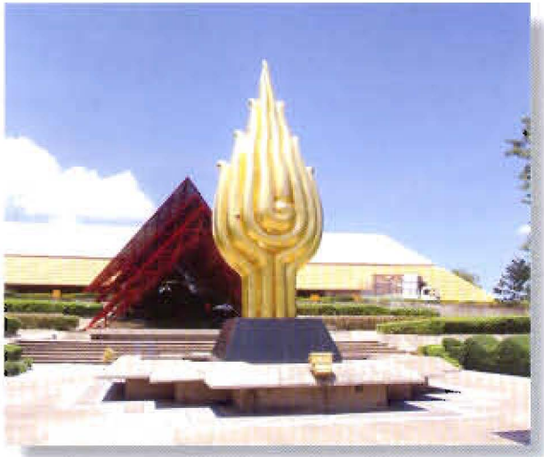
“Lokuttara” in front of the Queen Sirikit National Convention Center