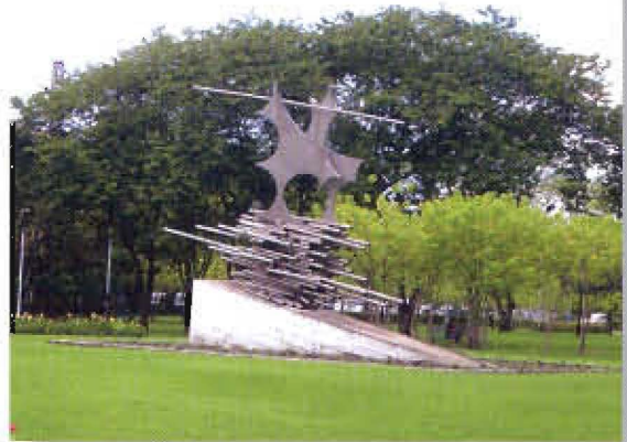
"Asean Sculpture" installed at Jatujak Park, Jatujak