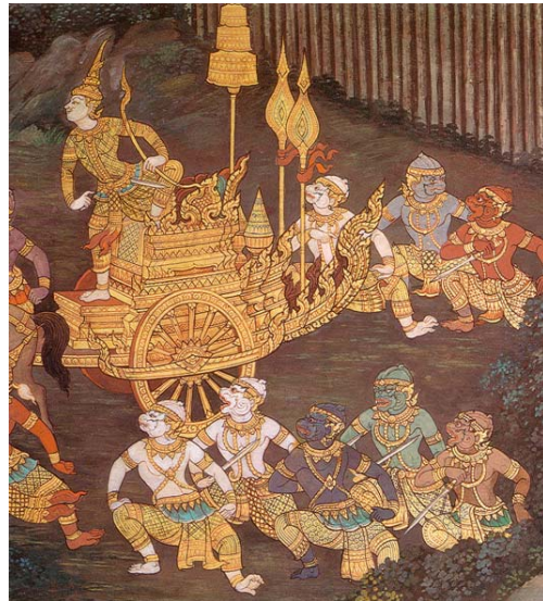
Mural paintings from Wat Sutastepwararam, Bangkok (legendary animals from the Himapan Forest)