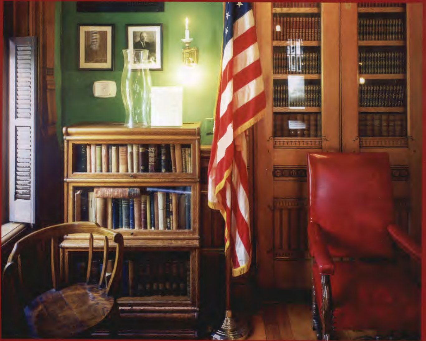
Interior, Willard Library, Evansville, Indiana, 2011