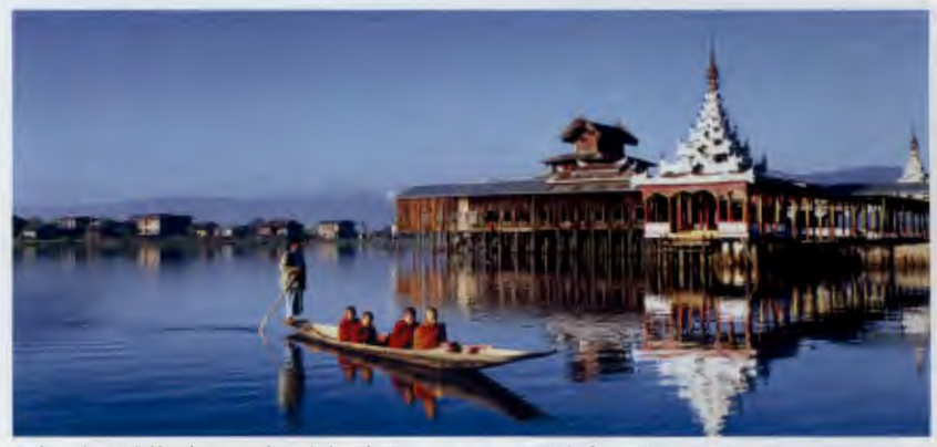
Monks in a long-tailed boat being rowed past the Nga Phe Kyaung monastery on Inle lake, Eastern Myanmar