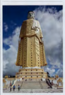
The colossal standing Buddha of Bodhi Tataung, near Mandalay