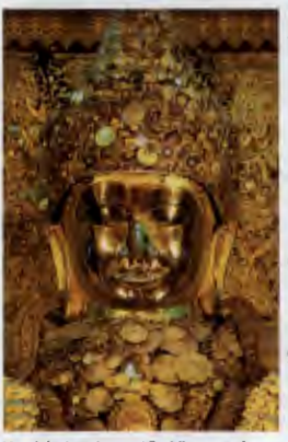
Mandalay's Mahamuni Buddha, one of Myanmar's most venerated Buddha statues