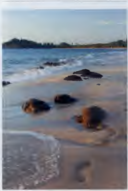
The clear turquoise waters of the pristine Ngapali beach, Western Myanmar